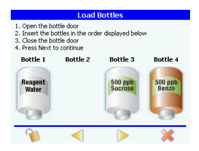
Fig. 6 All SOPs are loaded in electronic format and automated in the ANATEL PAT700

Following data errors, a typical response is to mandate re-training for the team. However, the industry and the FDA is gradually coming to the conclusion that this does not solve the problem it merely treats the symptoms for a short while until human error starts to creep in again and that the correct way forward is to reduce manual steps in the SOP in order to reduce the human errors and make the whole process more robust.